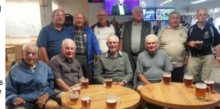
Enjoying a celebratory drink after the 70s v 80s clash on a drizzly Friday

on board and we are greatly for their assistance.